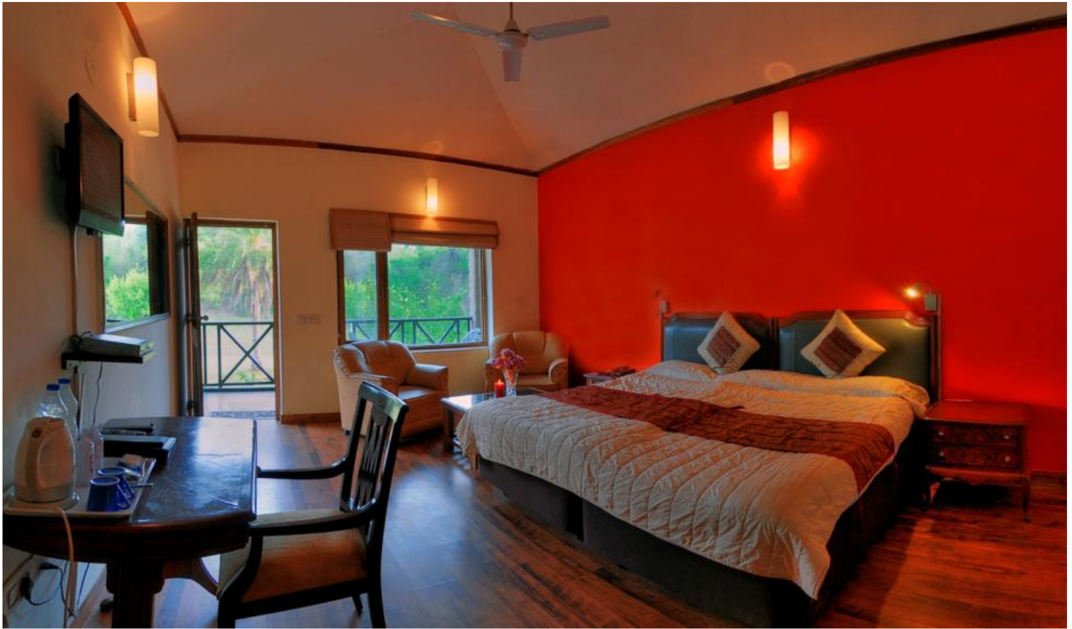
Garden View Room Interior