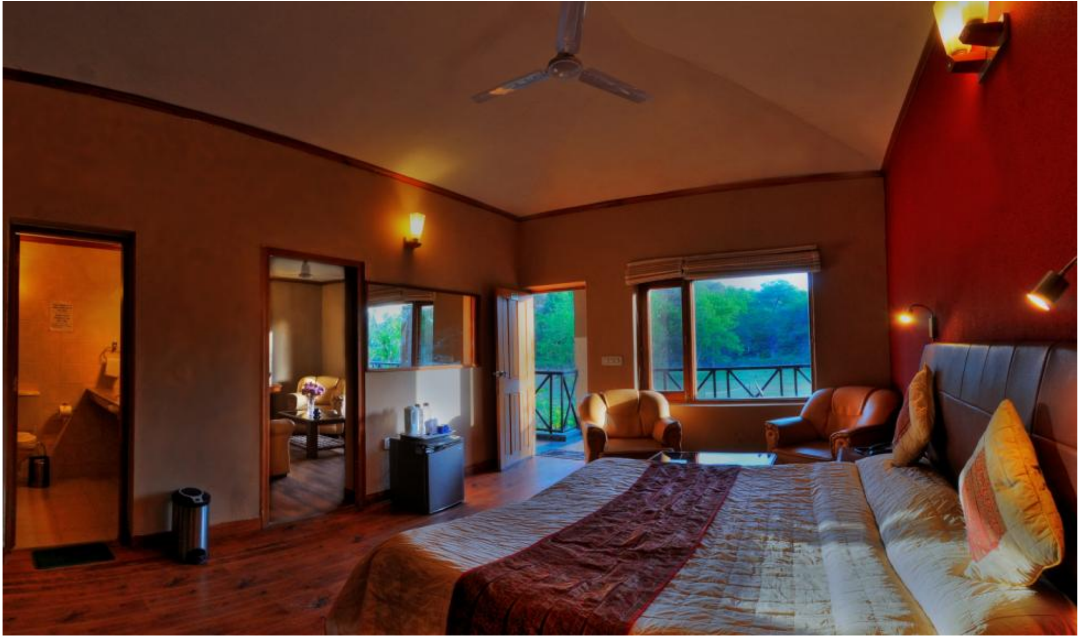
Garden View Suite Interior