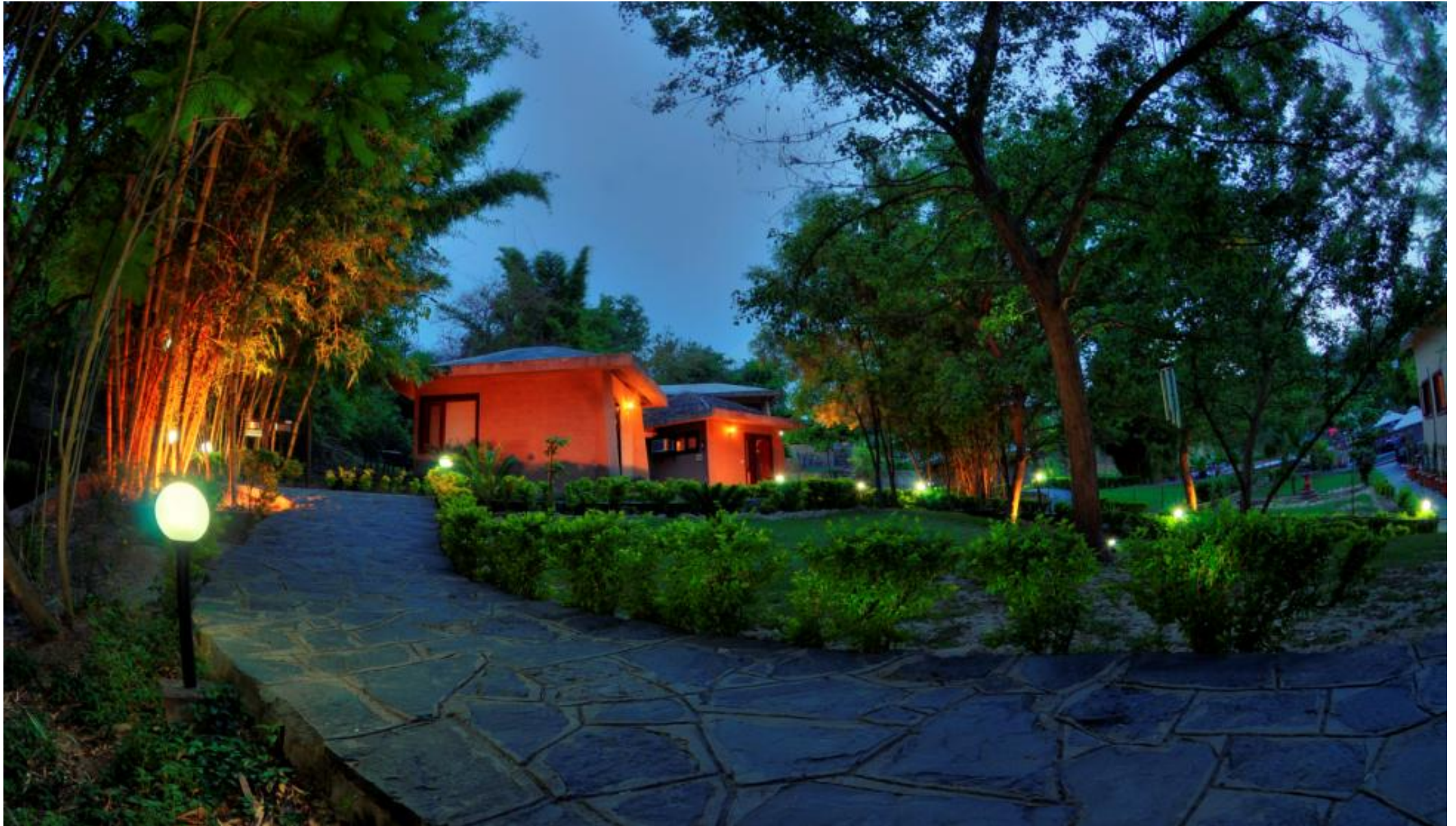
Eight – Pool View Cottages