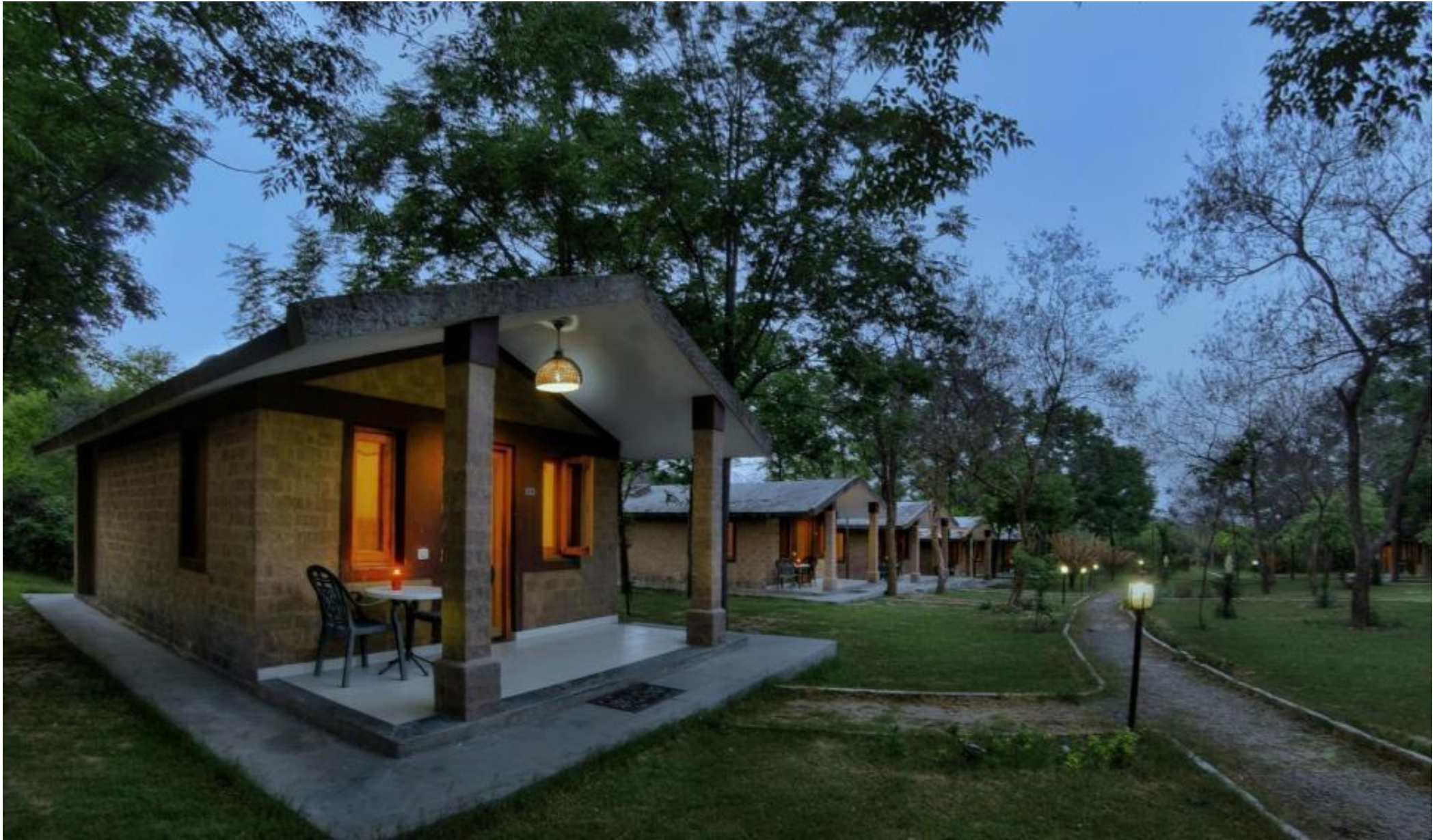
Forest View Cottage