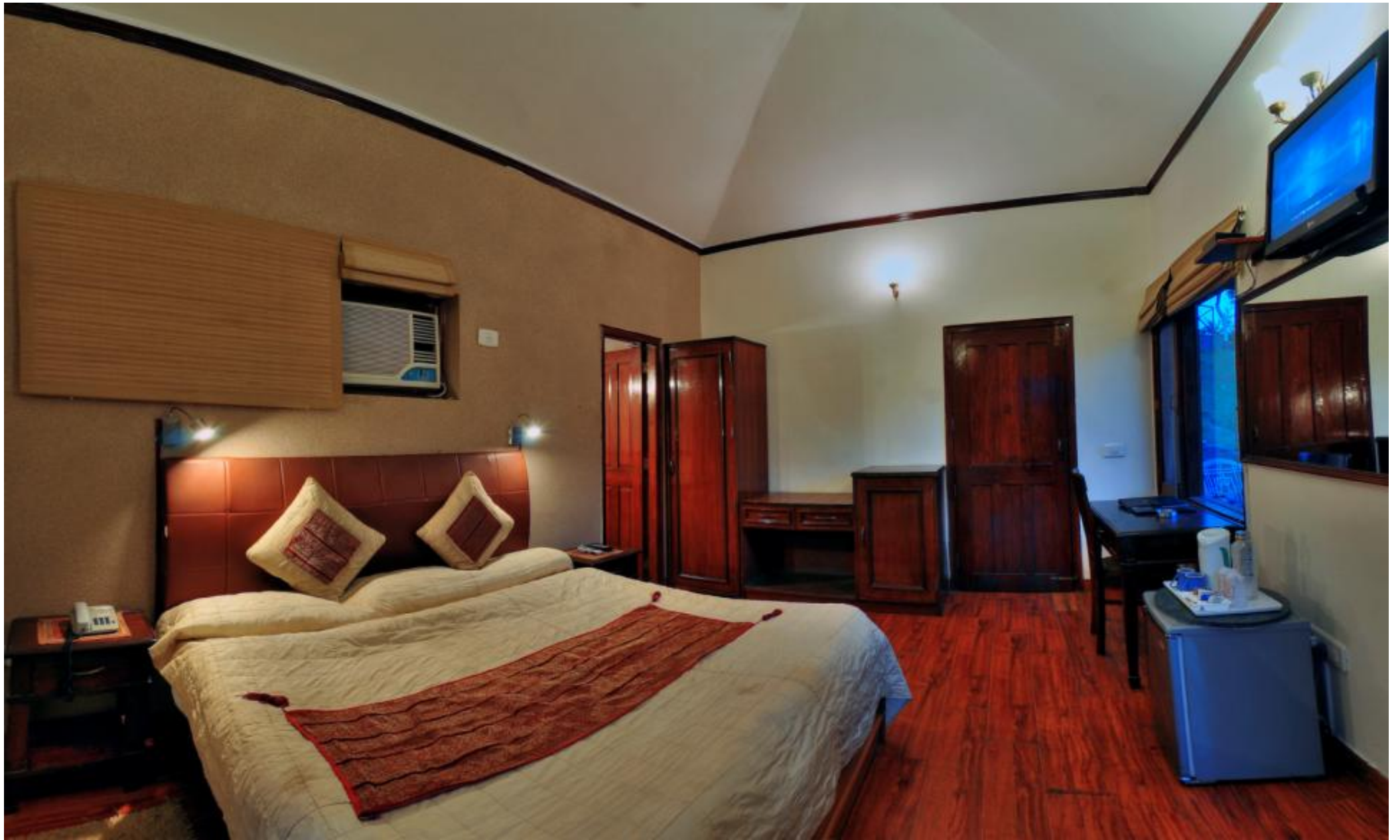
Pool View cottage Interior