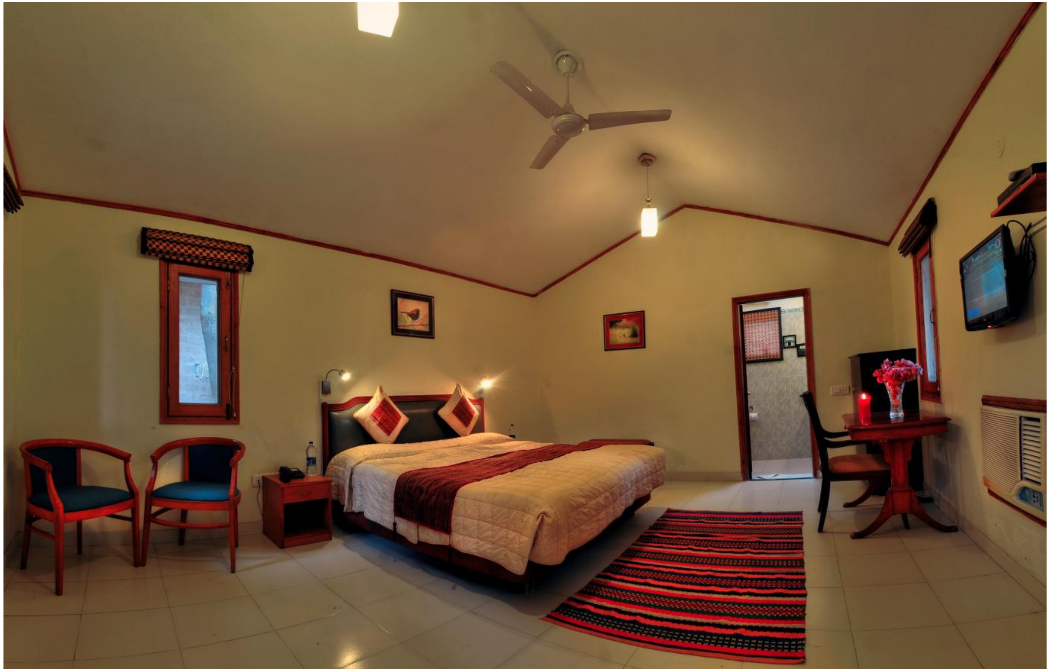
Forest View Cottage Interiors