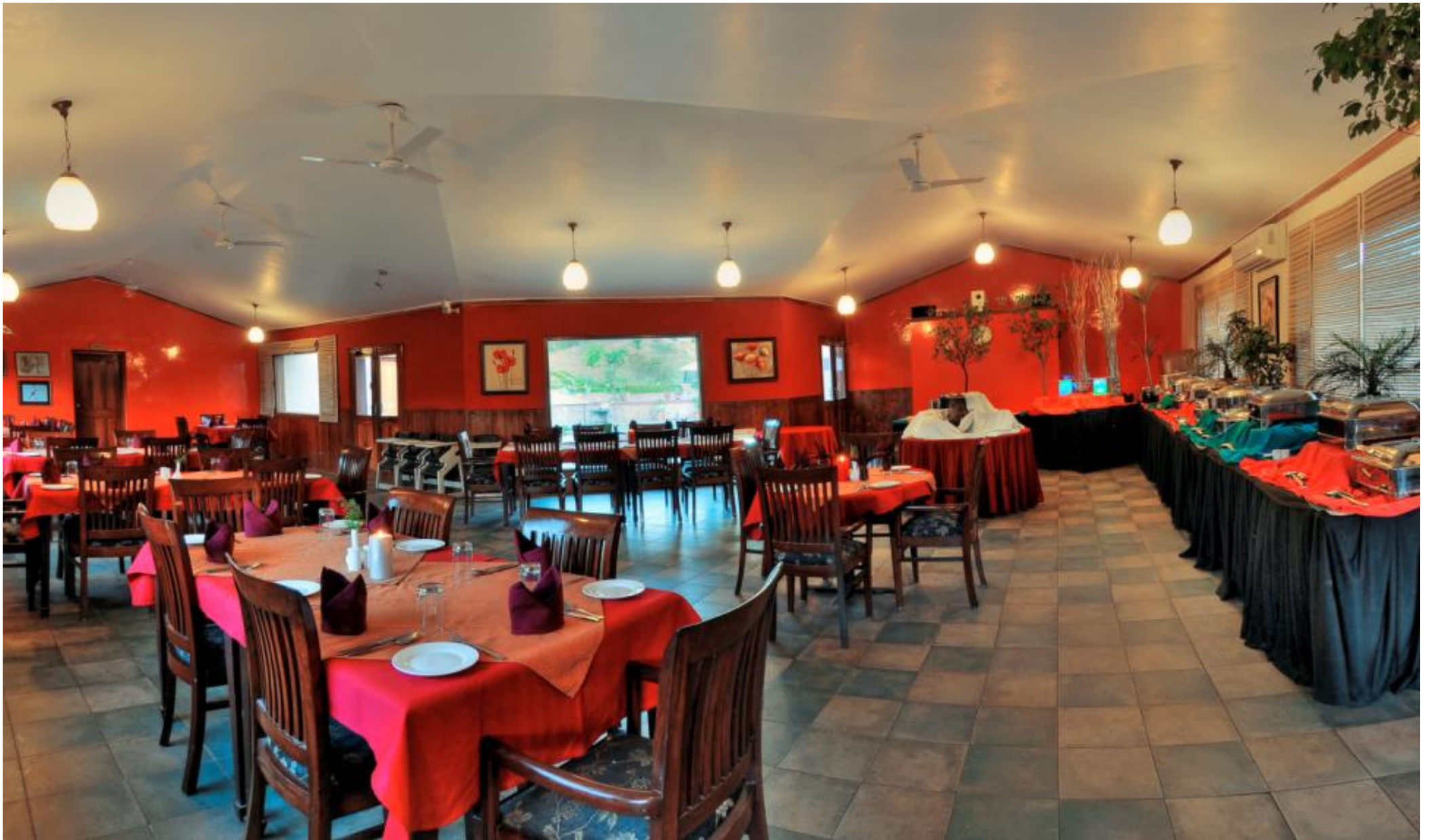
Pheasants Nest- Multi Cuisine Restaurant