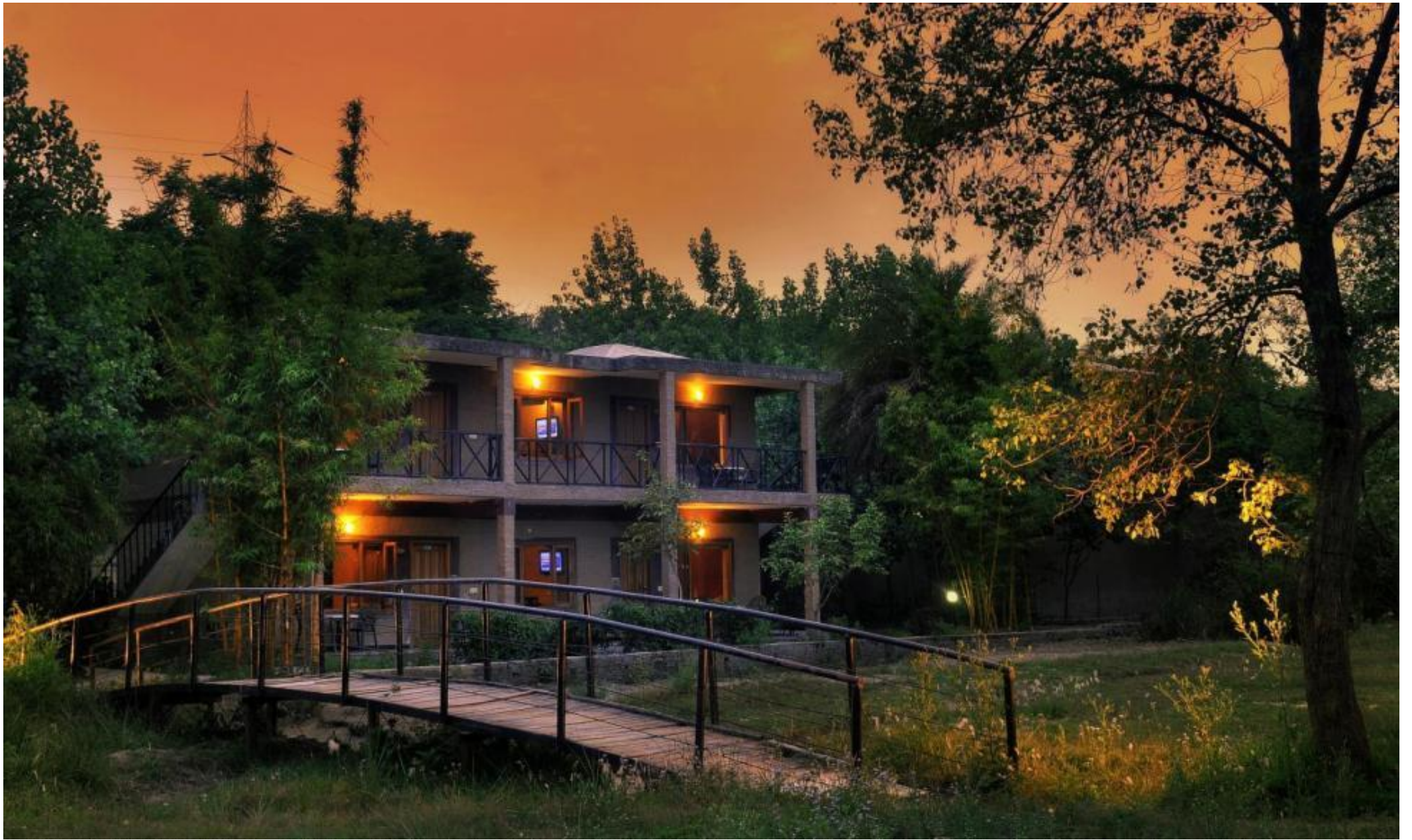
Six Garden View Rooms