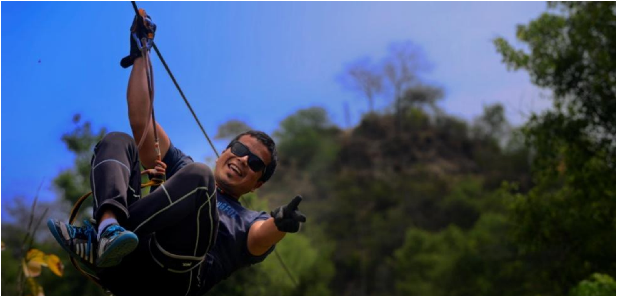
South East Asia's longest zip line spanning 2.2 kms.