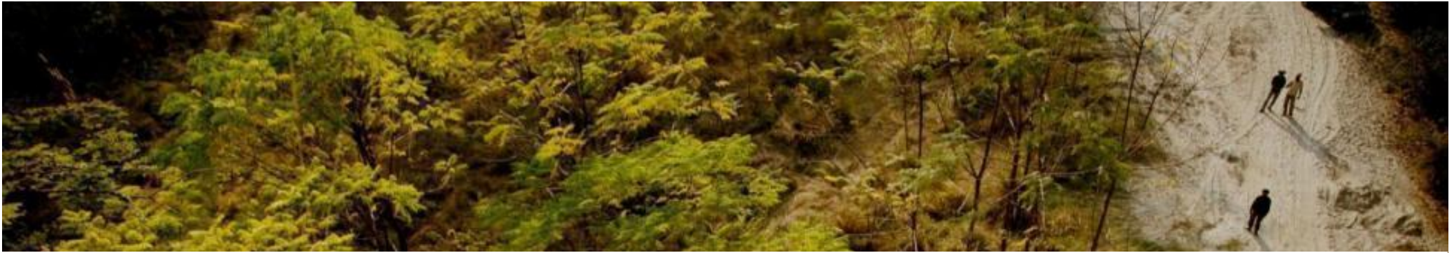
A Knee shaking experience at the 80 feet drop.