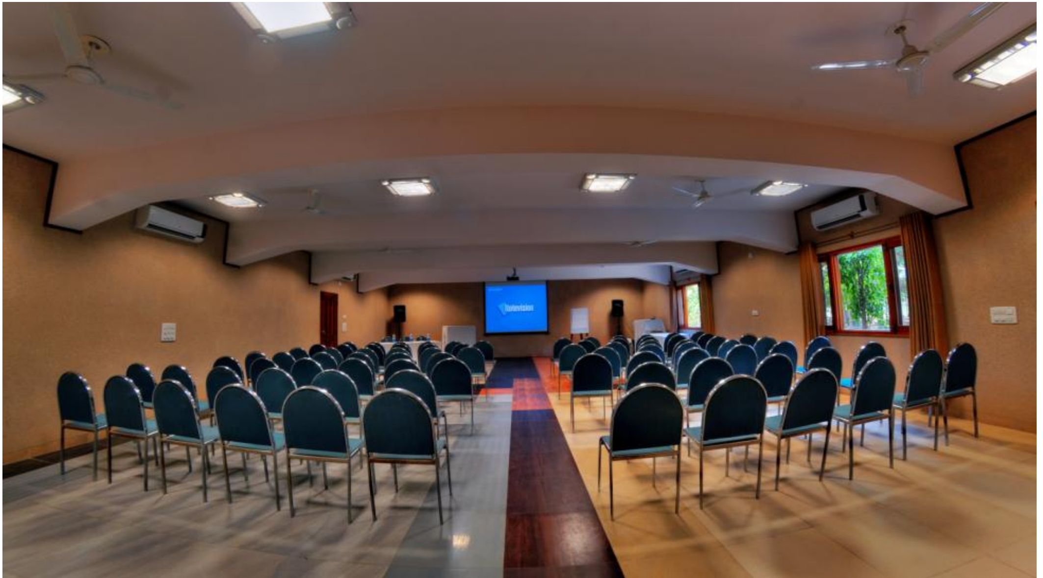
CONFERENCE HALL – Up to 120 Guests