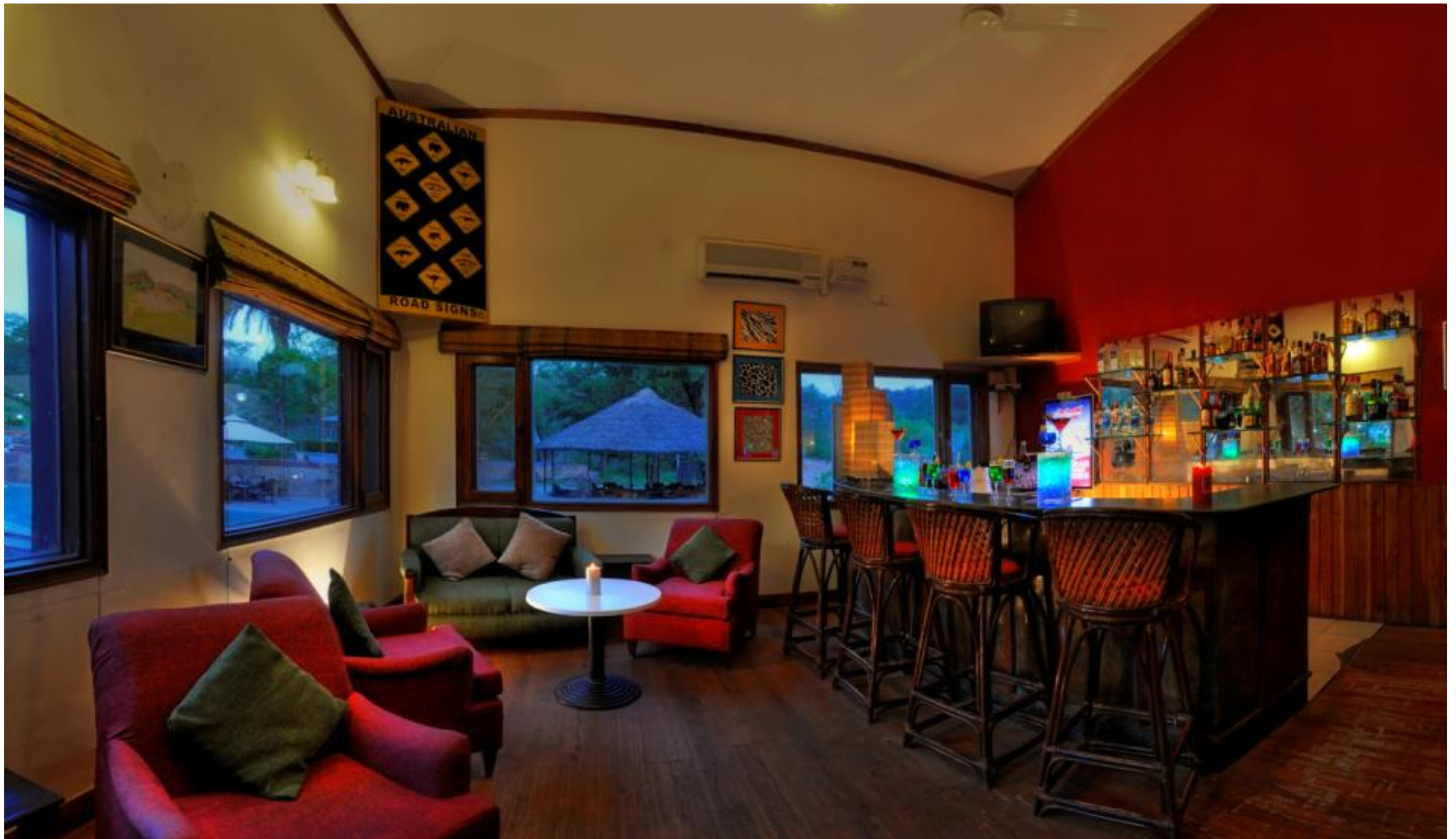
Watering Hole Bar –Pool Side